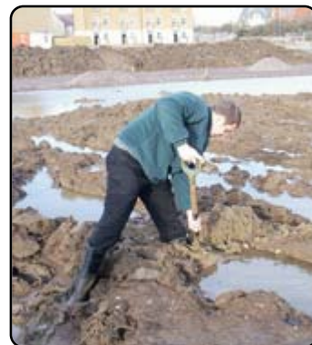
A Landscape Contract Manager trying to release water in footings for a path!

We will continue to monitor this situation very closely and will take the appropriate action, but we must stress that mobile phones are supplied for company use and users must abide by the company phone policy. If in doubt speak to your manager about the phone and do not think that it is there for your personal use.